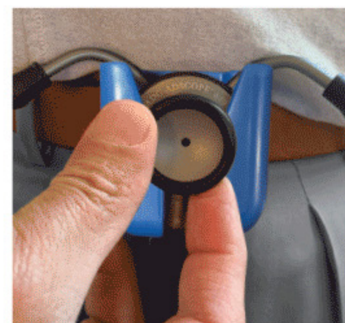
Slide chestpiece in slot.