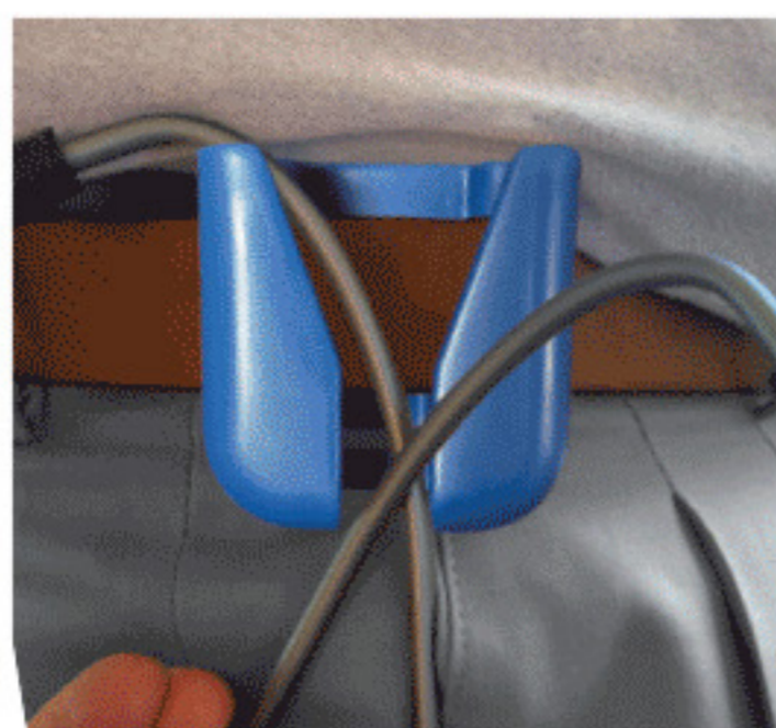
Holding the binaurals just above the Hip Clip, insert one into clip.