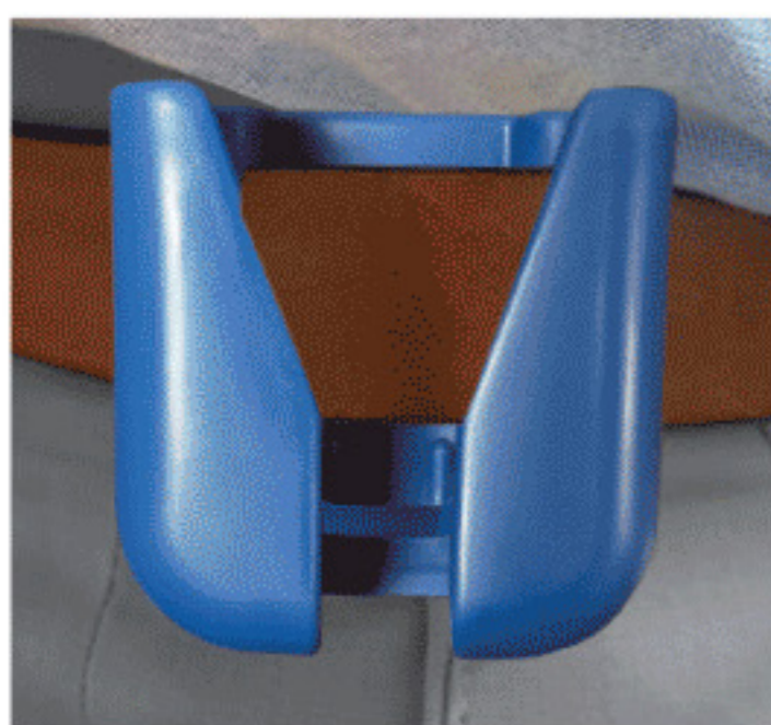
Attach Hip Clip to waistband.

Reduce neck strain Reduce chest tenderness Free your hands Cleans easily