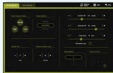
* Evaluation Mode Report