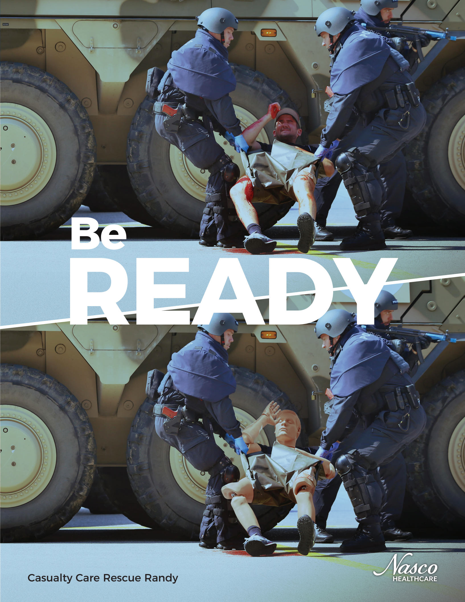
Casualty Care Rescue Randy

Nasco Healthcare Inc. 16 Simulaid Drive Saugerties, NY, 12477 USA Phone: 1-833-NASCOHC (627-2642) Email: info@nascohealthcare.com www.nascohealthcare.com